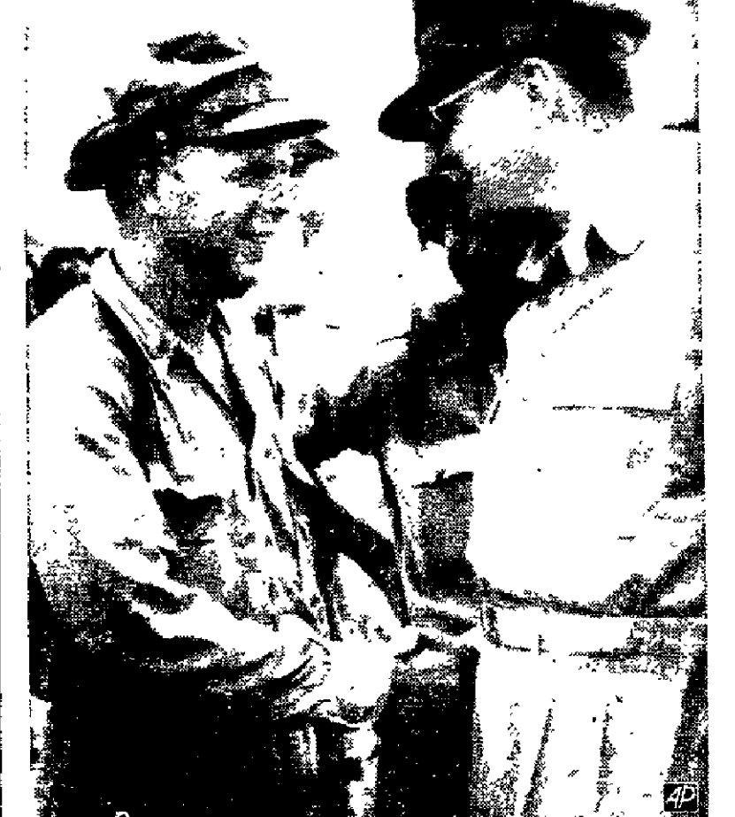
MAC ARTHUR GREETES BONG — Maj. Richard Bong (left) of Poplar, Wis., top army air forces fighter pilot with the highest number of enemy kills to his credit, shakes hands with Gen. Douglas MacArthur, commanding U. S. forces in the Philippines, as the Badger flier arrived on a newly opened airstrip on Leyte island.

An American Base on Leyte—(P)—One pass at a Japanese plane and Maj. Richard I. Bong, Poplar, Wis., today increased his score to 34 enemy planes downed in aerial combat.